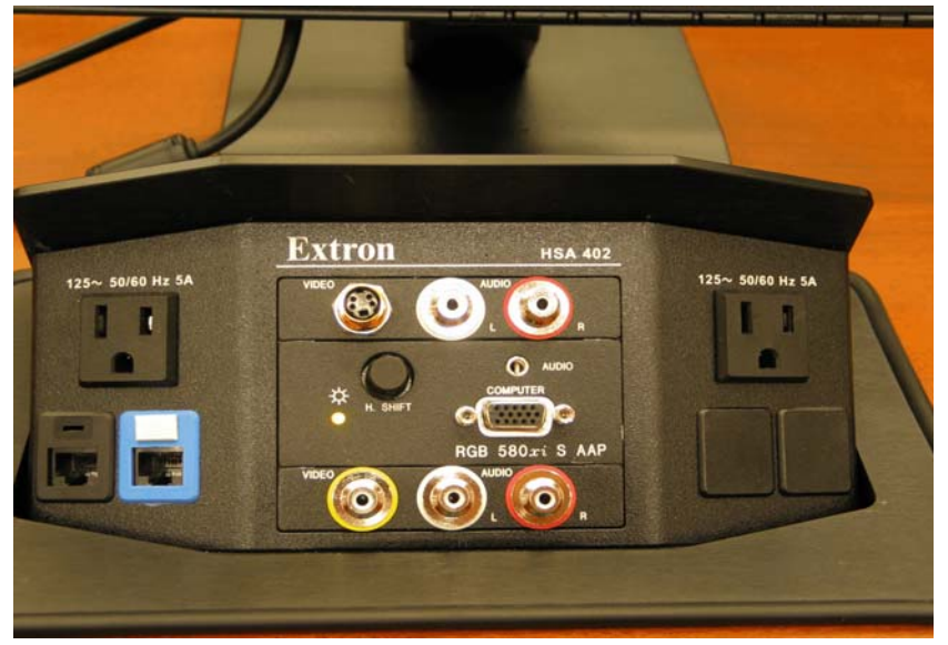
Black RJ-45 jack is for Real Time Transcription, Blue is for network (Not used: replaced by WiFi).

There are also computer inputs at all counsel tables (additional video inputs at select tables) and the lectern, as illustrated in the image to the right. The connectors on the top row are called S-Video and the bottom row of connectors are called Composite connectors. The center connector is for computer video. When any of these video sources are selected using the AMX touch panel (video selection menu), the associated audio connections are also active. These allow counsel to bring a variety of different types of portable tape decks into the courtroom and play the audio over the loud speaker system. The