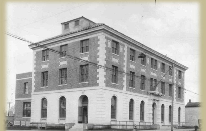
Federal courthouse at Coeur d'Alene, 1928.