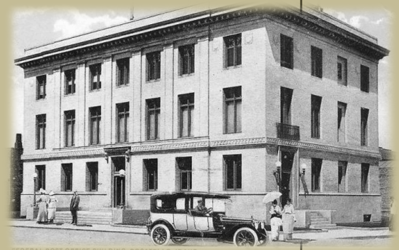
Postcard showing federal courthouse at Pocatello, early 1900s.