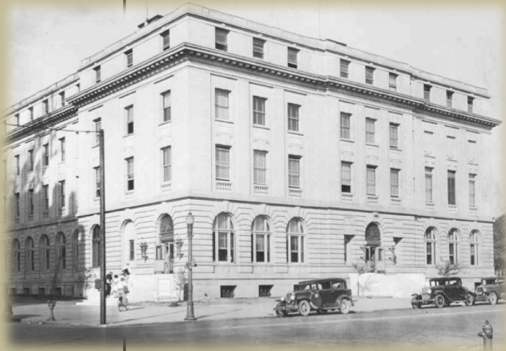
Federal courthouse at Boise, 1905.