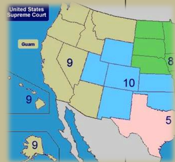
U.S. Ninth Circuit area.