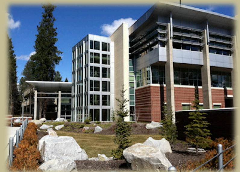
Federal courthouse at Coeur d'Alene.

At the close of the twentieth century , a new, state of the art federal courthouse opened at Pocatello in 1999. Ten years later, in 2009, a new federal courthouse opened at Coeur d'Alene, Idaho.