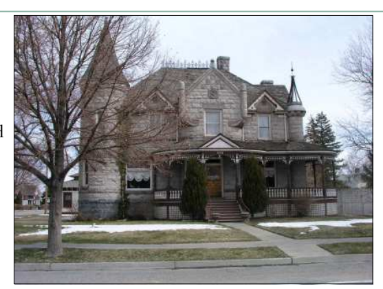
Standrod Mansion.

Standrod was elected district judge for the Fifth Judicial District in 1890 and held that office until 1899 when he returned to legal practice in the Pocatello, Idaho firm of Standrod & Terrell. He moved to Pocatello in 1895 and huilt an ormate 16 recent classical revival style house in 1