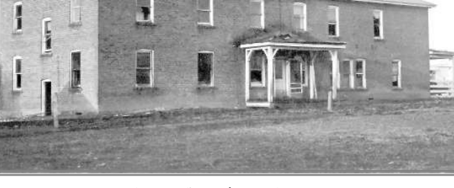
Bonner County's poor house.